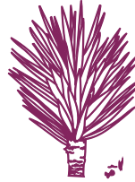
agave cupreata agave marmorata agave karwinskii