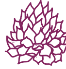
agave tequilana agave angustifolia agave potatorum